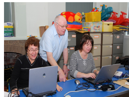
Digital Imaging Course— Woodhouse Library

Should you require any other courses, Jackie and Liz can help you locate the nearest suitable provider.